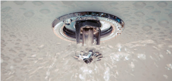
Discharge might occur if a sprinkler head is accidentally overheated or damaged