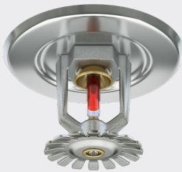
A typical automatic sprinkler head

In Canada, both National and Provincial fire codes require sprinklers to be installed in many types of new buildings, as well as buildings that are being repurposed and / or undergoing major renovations. A number of provinces also require older buildings to be retrofitted with fire sprinkler systems — for example, buildings that are used as schools and long term care facilities. 1