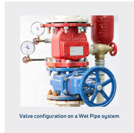
Valve configuration on a Wet Pipe system